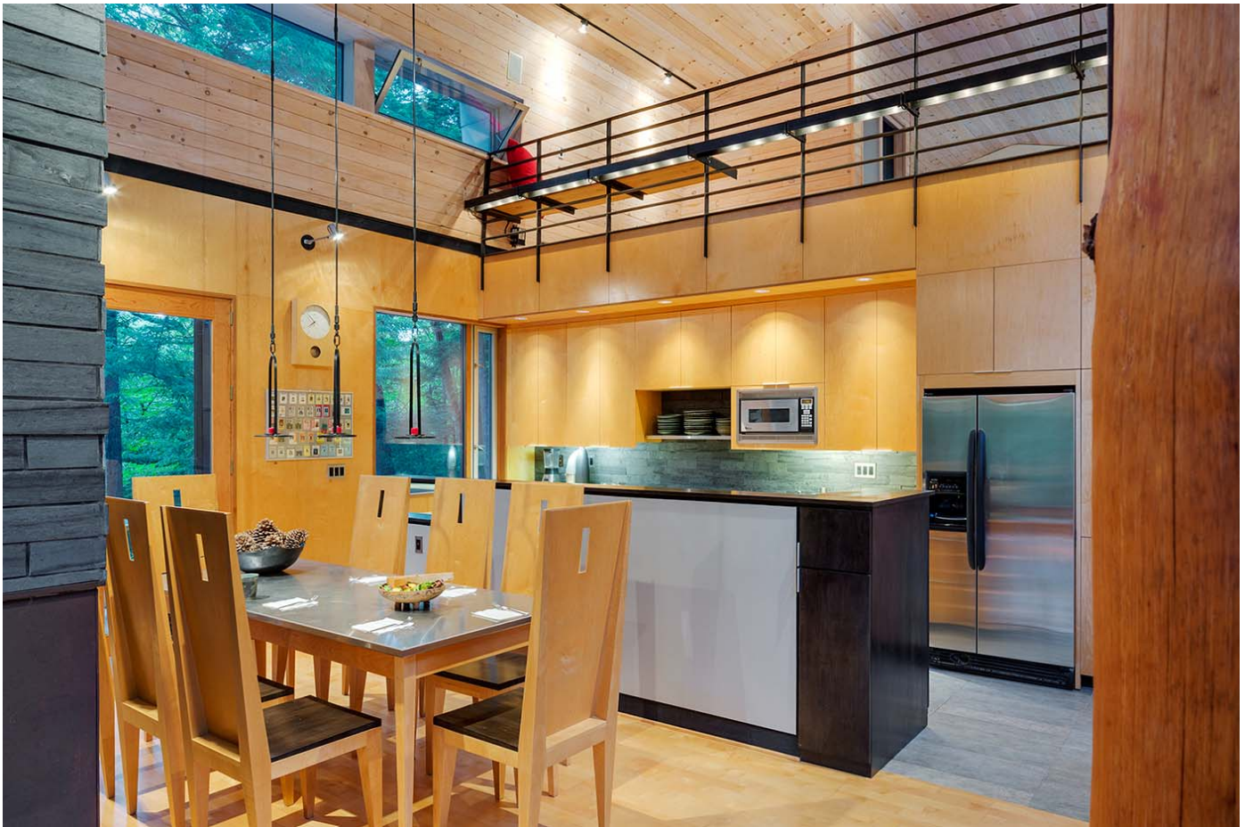
Architect Andrew Dunbar, of INTERSTICE Architects in San Francisco, California, designed the maple dining table and chairs, which echo the design of the hearth and vertical windows. Kitchen cabinetry and walls are plywood; the ceiling and upstairs walls are knotty pine.

Dunbar designed a tin roof as a sheltering element that extends over the front of the home; the overhang provides passive solar energy that helps heat the house in the winter and keeps the space cooler in summer. Scaled tin panels cover the north and east sides of the house, accented by natural concrete and wood walls, which provide tight insulation. A wraparound deck, accessed by all ground-floor rooms, overlooks the mountains on one side, the river on another and a row of birch trees planted alongside the house. Floor-to-ceiling windows open into the roof framing in back of the home. “The windows let in lots of light, help solar warmth and allow views of the changing trees during the seasons,” Dunbar says.