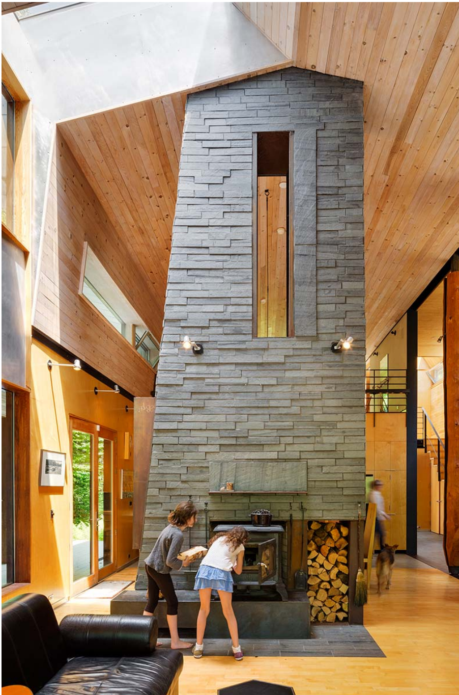
A soaring twenty-five-foot-tall hearth wall, constructed of Vermont slate, divides the living and dining spaces. Wall-mounted lights and track lighting throughout eliminate the need for lamps.

and Saco River, the two-thousand-square-foot, two-level home is intimate yet spacious. The Astrachans were interested in using all-natural materials; there are no painted or stained walls inside and no carpeting because of the radiant-heated floors. Dunbar suggested low-maintenance building materials—plywood, concrete, tin, Vermont slate and knotty pine—that evoked local landmarks, such as woodsheds, barns and mountain lodges.