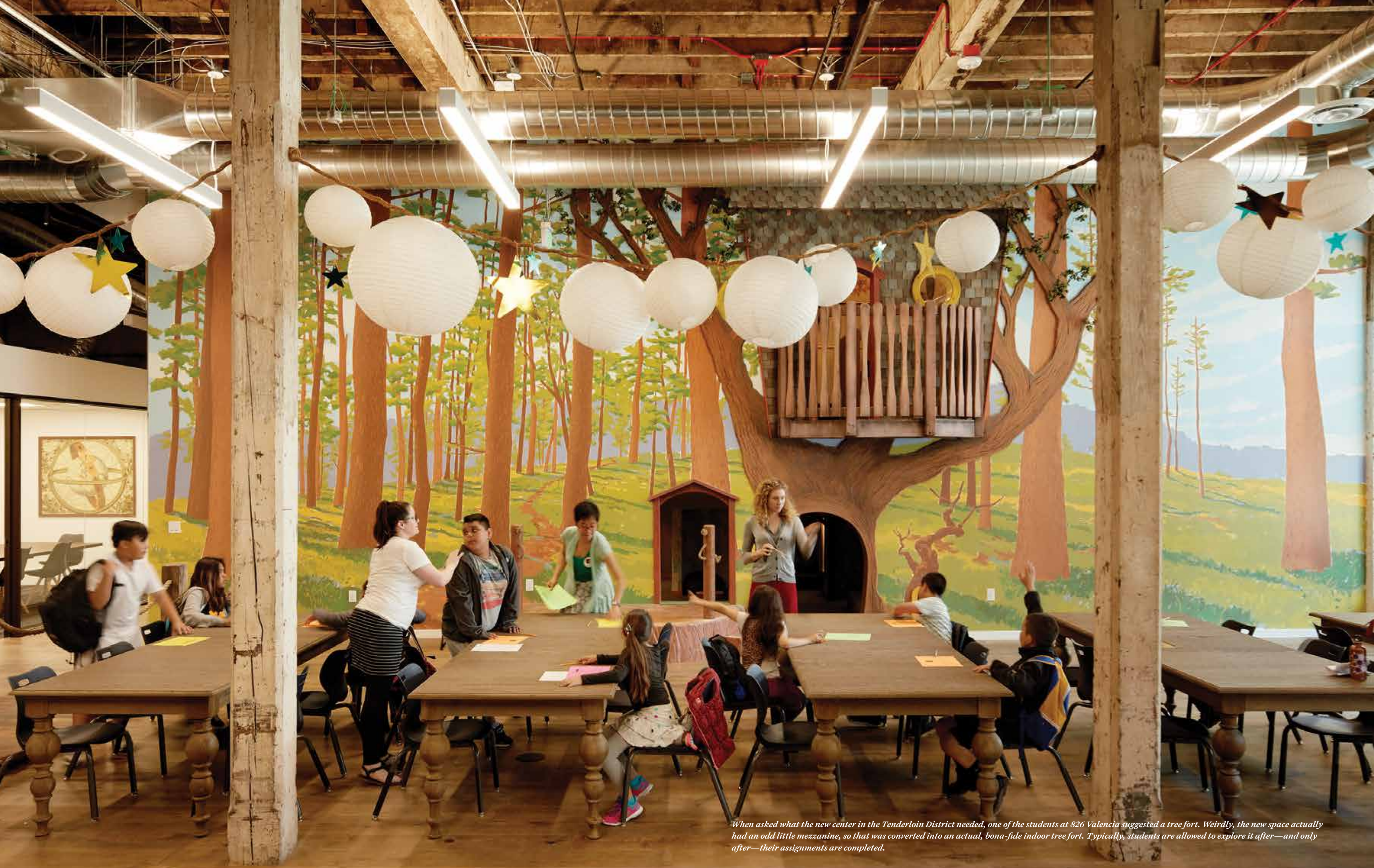
When asked what the new center in the Tenderloin District needed, one of the students at 826 Valencia suggested a tree fort. Weirdly, the new space actually had an odd little mezzanine, so that was converted into an actual, bona-fide indoor tree fort. Typically, students are allowed to explore it after—and only after—their assignments are completed.