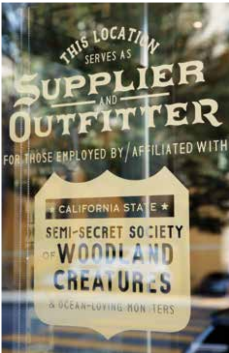
Woodland creatures are rare but welcome visitors.