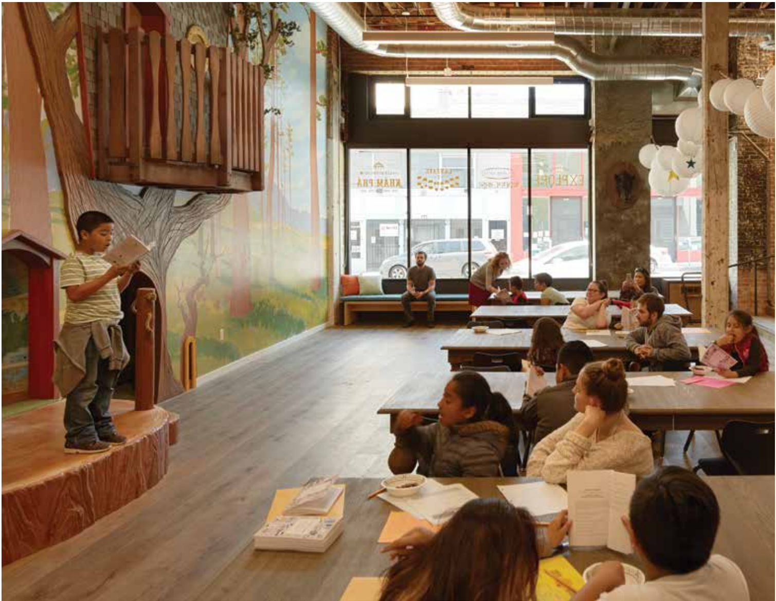
Many (even famous) writers have never had the opportunity to read on a large tree stump. Not so for students who come to 826 Valencia: Tenderloin Center.