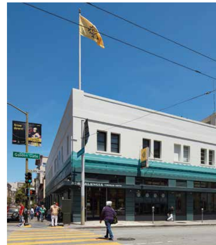
The center is walkable from the original location; it's not reachable by boat.