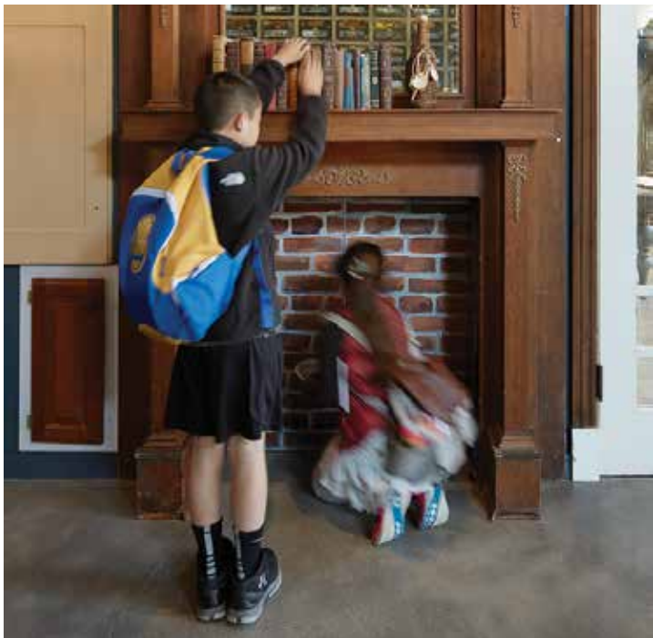
Furthermore: if at all possible, include multiple secret doors.

While working with more people is, in some ways, more work, it makes each piece of the project more manageable on a budget. It also engages the community in the space from the beginning. Always focus on the mission and how what you're doing makes a positive impact on the students and community. Treat this ask much like you would any monetary donation: be clear about purpose, explain the opportunity in an inspiring manner, express lots of gratitude all the time, and have excellent follow-through on all tasks to make it easy for people to be involved. Also, engaging passionate pro bono partners ensures one more advocate asking others to be generous as well. Our construction partner asked every subcontractor if they would donate their portion of the project and often the answer was yes. ●