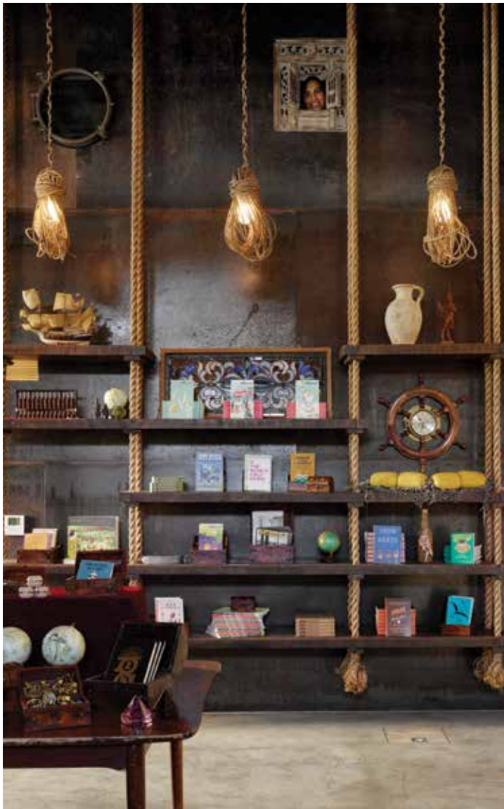
Can you find the human hiding in this photo?