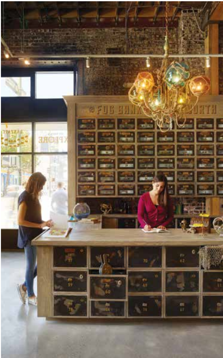
The Fog Bank allows one to withdraw fog, a common currency in San Francisco.