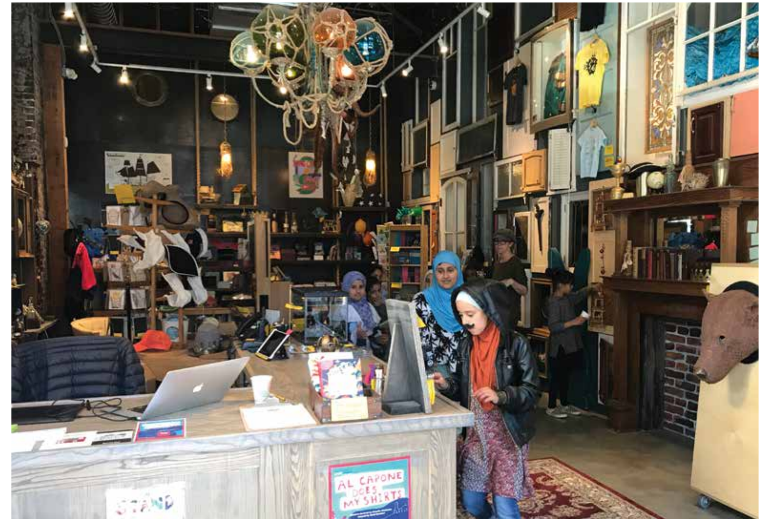
(Opposite) One almost feels underwater as they enter the emporium. (Above) Customers are treated to souvenirs from the travels of King Carl, the royal pufferfish.