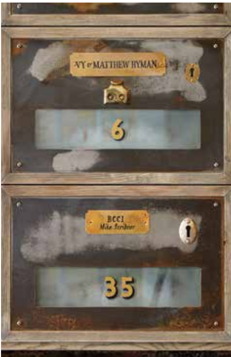
Drawer nameplates honor donors to the center.