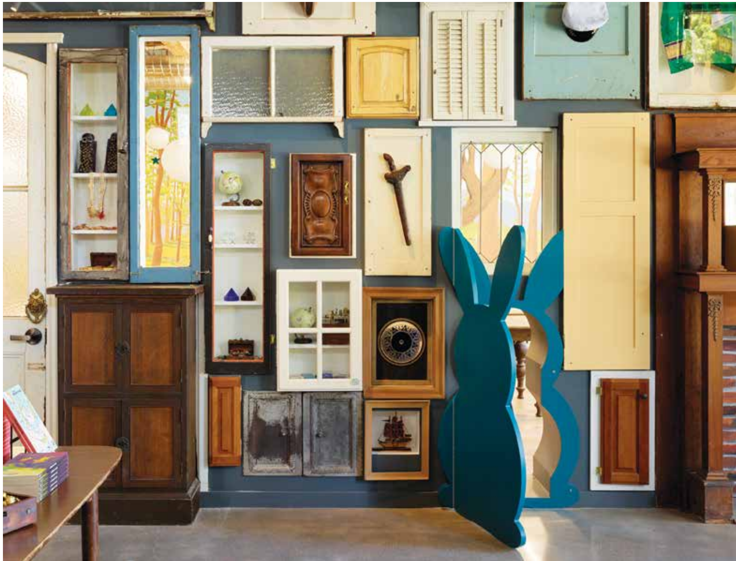
One important takeaway from this book: if at all possible, include a secret door.