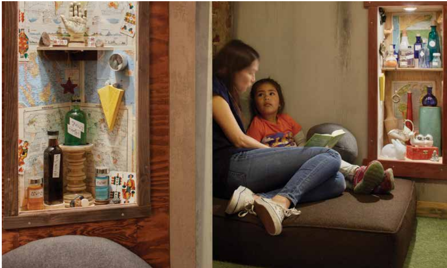
Woodland creatures, ocean-loving monsters, and humans alike love nooks, crannies, and display cases with items of interest.